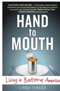
picture of course text hand to mouth 1is above